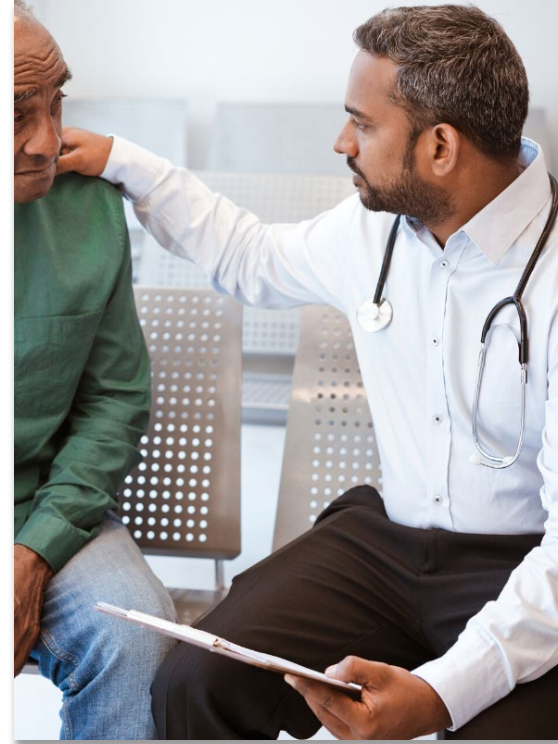
Physician - ACCME