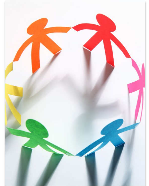
Other Community Sectors