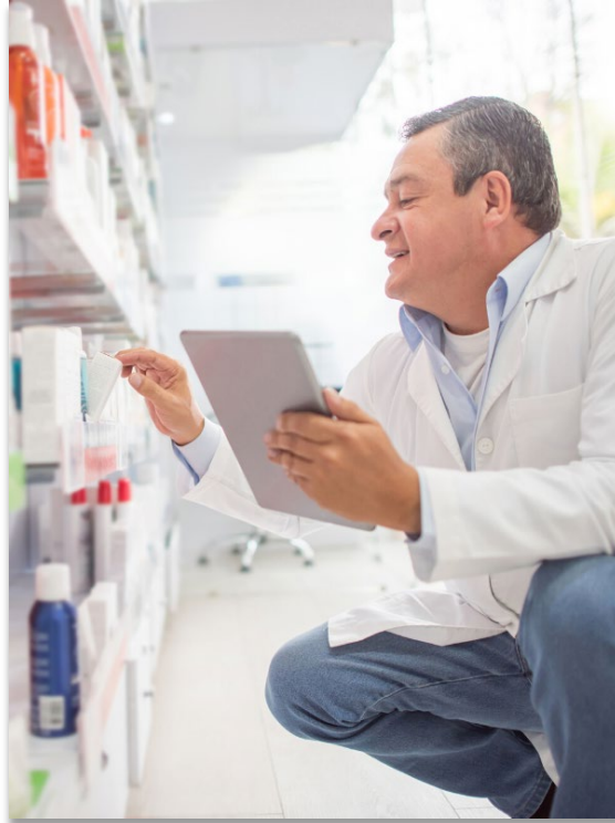
Pharmacy - ACPE