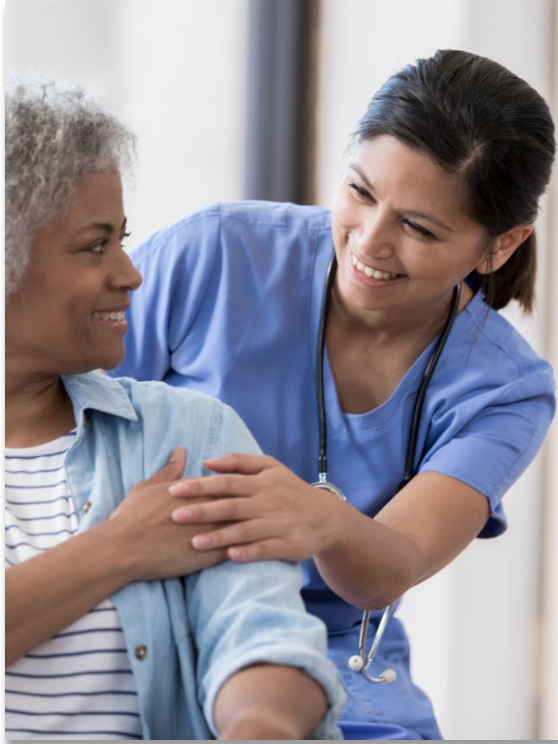
Nursing - ANCC