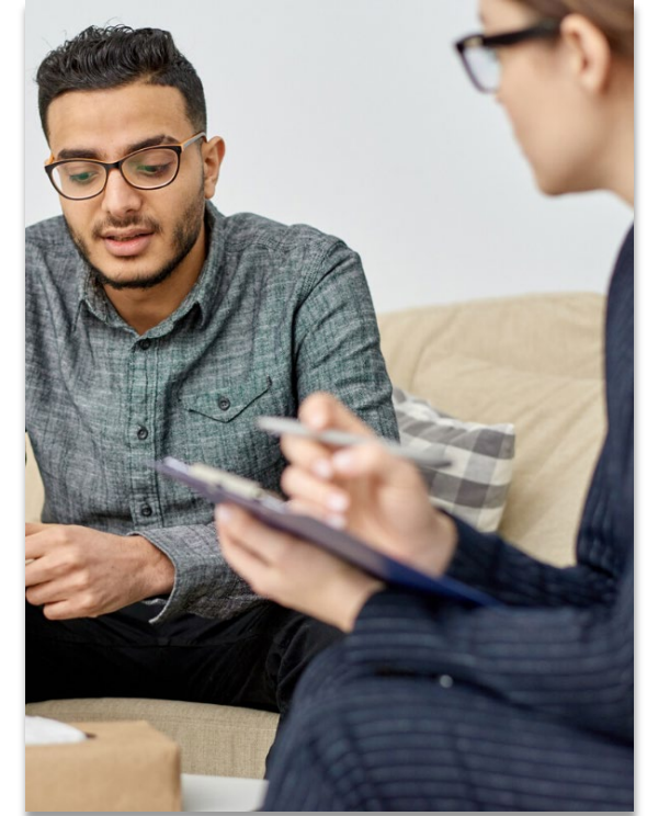
Other Healthcare – AMA PRA Category 1